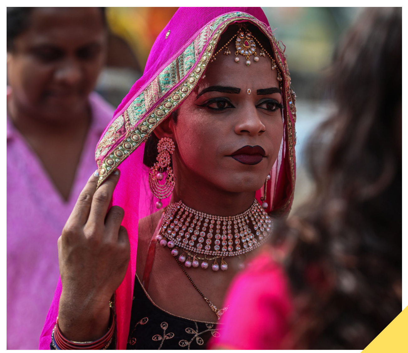
Hijras are officially recognized as third gender in countries in the Indian subcontinent, being considered neither completely male nor female. This picture is from the sixth pink rally in Mumbai, India, 13 January 2020. The rally is organized to demand shelter home, social visibility, equality, empowerment, end of discrimination and to raise awareness about different issues of transgender and Hijra community.

Gender Studies, with scholarly work in the field making important contributions to feminist and SOGIE advocacy.