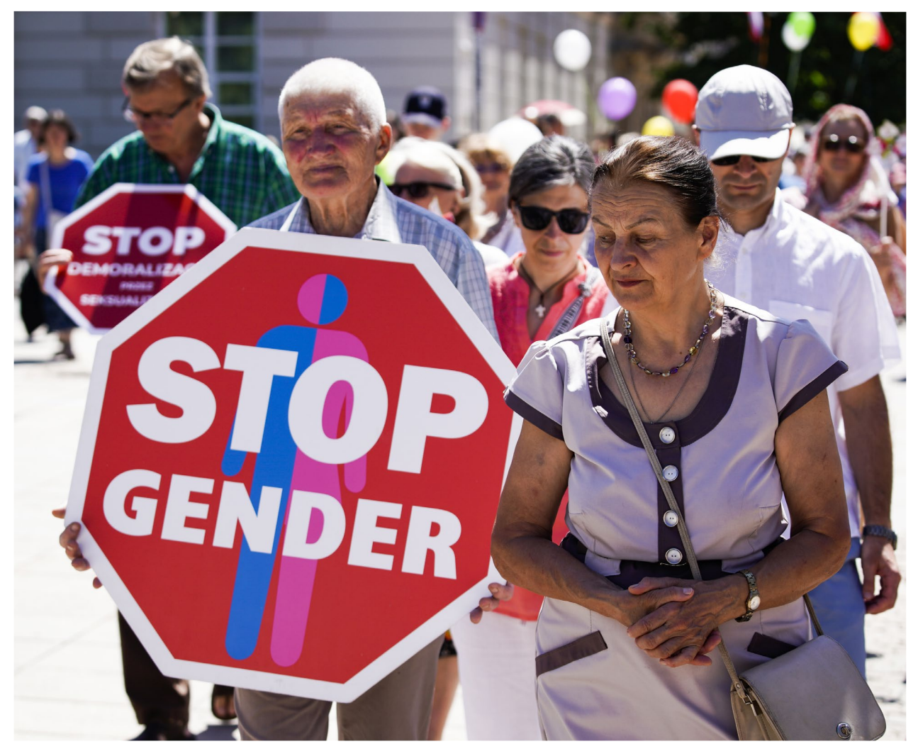
People are seen taking part in the March for Life and Family in Warsaw, Poland on June 9, 2019. Several thousand people took part in the march that was meant to counter the gay pride march of the previous day.

images of conservative groups and action being led by older generations who use religious-based forms of condemnation as a central rhetorical device (Paternotte & Kuhar, 2018, p. 10). Rather, contemporary anti-gender political messages are presented as secular, rational, commonsense, and moderate responses to SOGIE rights that have "gone too far" (ibid). As Kuhar and Zobec (2017, p. 36) write: "The anti-gender movement presents itself as modern, young and hip. In most cases, the movement tries to hide its religious connections and create a secularising selfimage that cannot be reduced to previous forms of conservative resistance against gender equality and sexual rights." Anti-gender campaigns are active online and offline. Their internet advocacy often takes