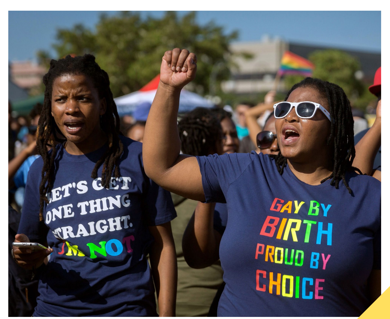
South Africa was the first country in the world to safeguard sexual orientation as a human right in its Constitution. Here from the Durban Pride in 2017.

entitled to regulate higher education and research. Therefore, SAIH hopes that this report will create awareness in academia and among Norwegian politicians and decision-makers about the key role that education and research plays in the work for LGBTIQ+ rights, and the current threats against this work.